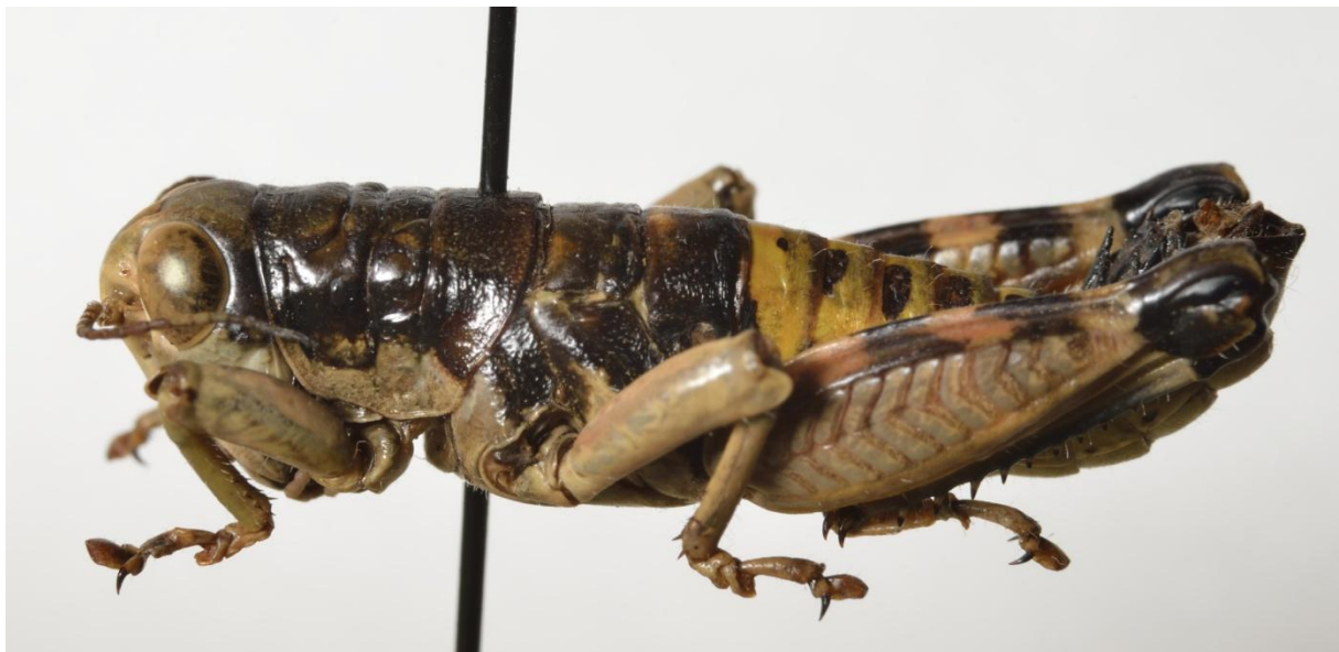
Figure 1. Peripodisma ceraunii ♂. Holotype.