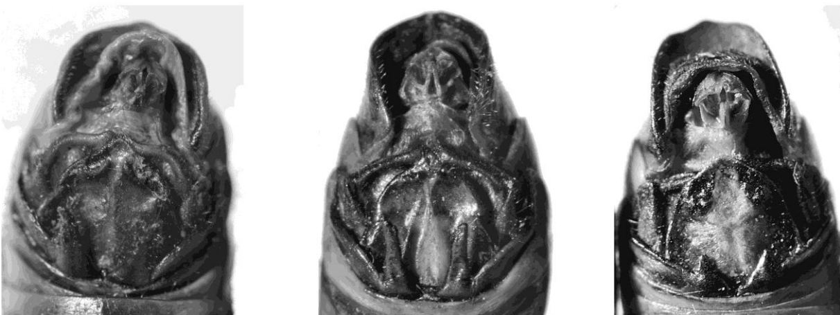
Figure 4. Abdominal apex of male: Peripodisma ceraunii (left), P. Ilofizii (middle) and P. tymphii (right).