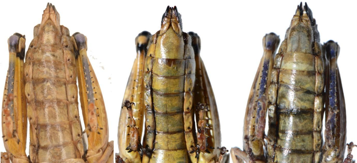
Figure 3. Ventral view of the abdomen of female: Peripodisma ceraunii (left), P. Ilofizii (middle) and P. tymphii (right).