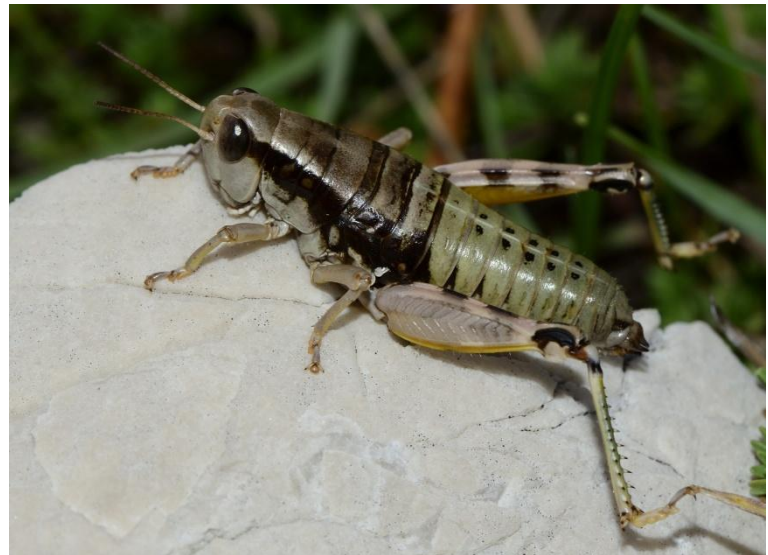
Figure 9. Peripodisma ceraunii ♀, between Maja and Mt. Qores, Albania.