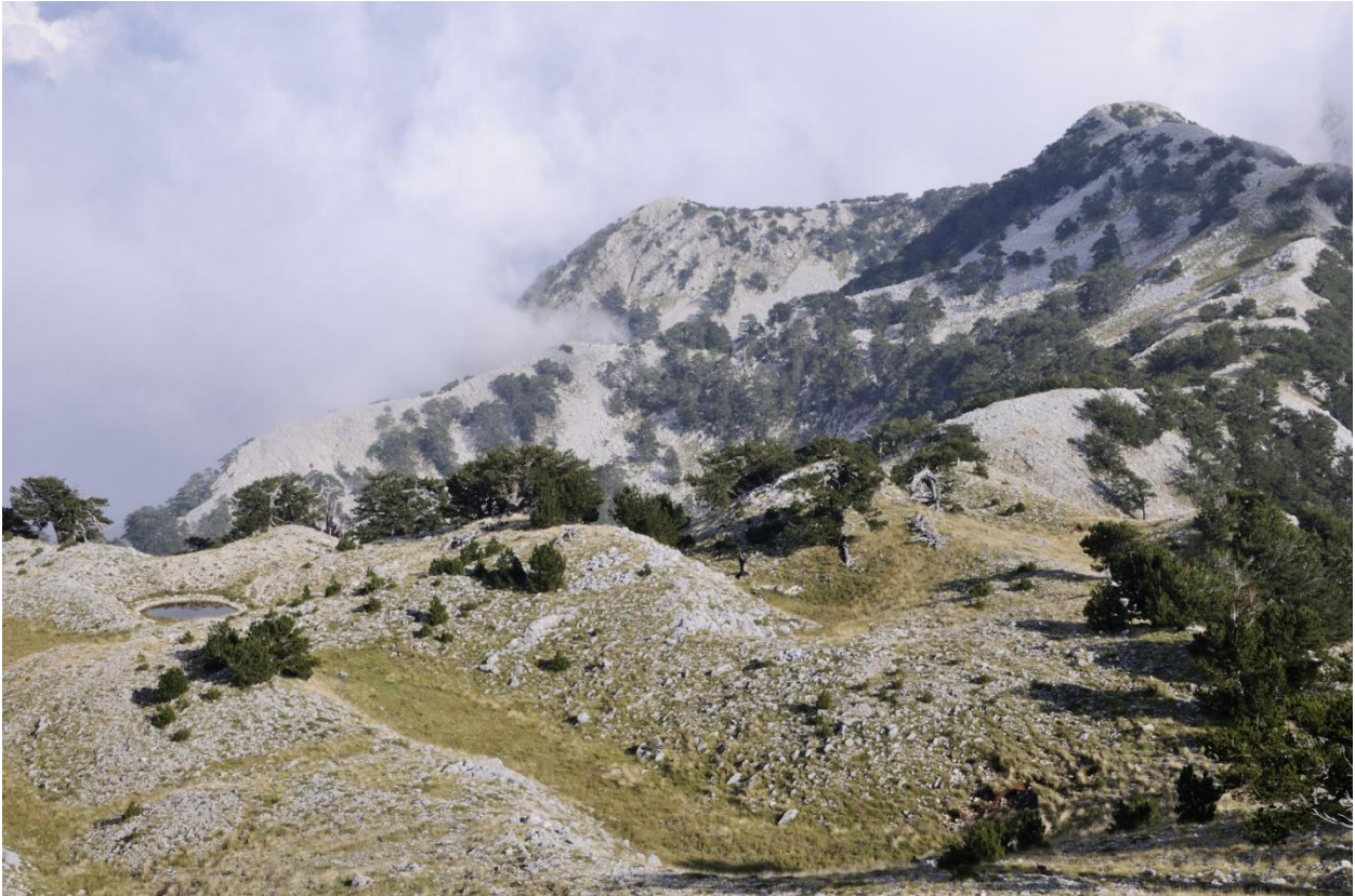
Figure 7. Mt Qorres, Albania.