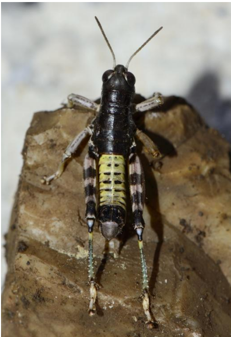
Figure 8. Peripodisma ceraunii ♂, between Maja and Mt. Qores, Albania.