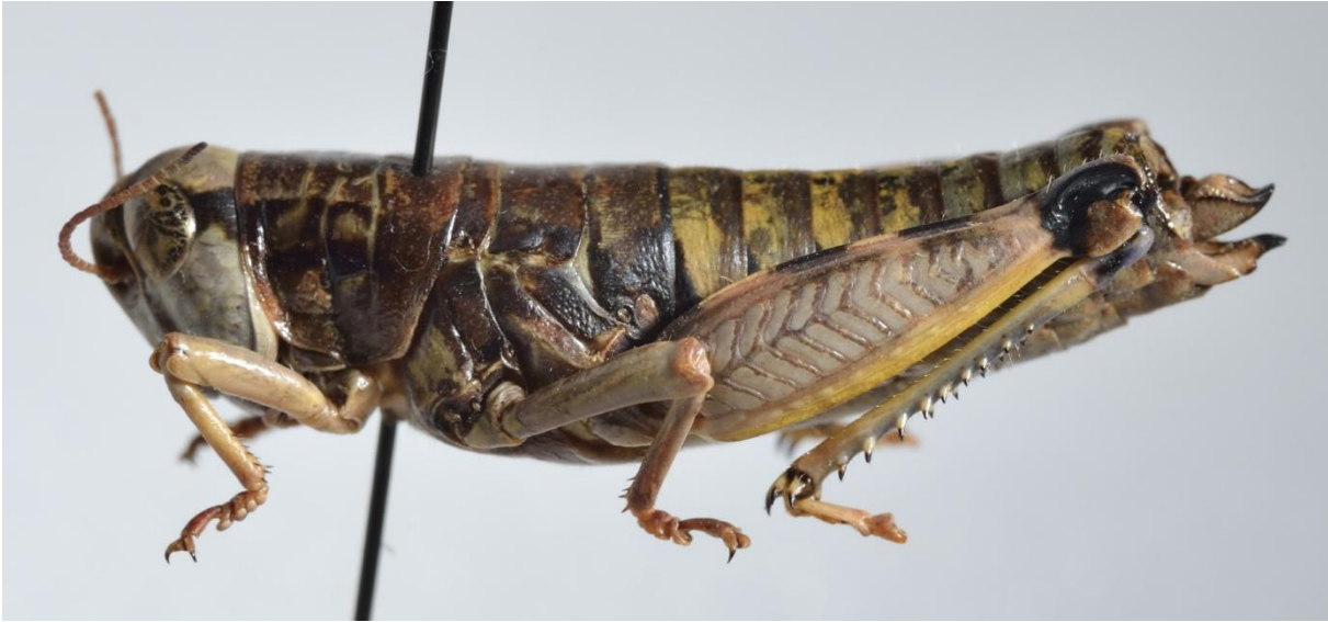
Figure 2. Peripodisma ceraunii ♀. Allotype (Paratype).